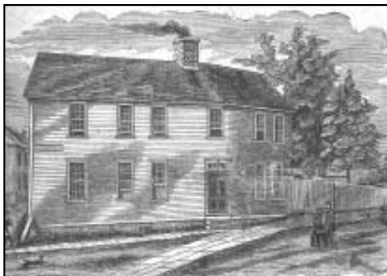
Daniel Fowle House

Research on this project turned up some pretty wild tales. NH's first printer, for example, immigrated to Portsmouth after being thrown in a Boston jail for his seditious