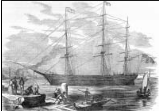
Witch of the Wave , Gleason's Pictorial Drawing-Room Companion, June 14, 1851

Each of the 40 or so models in the Athenæum collection reflects the history of one or more great merchant sailing vessels. Many are documented in publications owned by the Athenæum with brief histories of their travels, their crews and their functions, reflecting varying degrees of success at sea. Destructive events such as fire or sinking are noted, as are sales that take the ship out of U.S. ownership. A large number in the Athenæum collection came to us from the Gray and Prime Coal and Salt Co. collection. This company occupied the premises earlier occupied by E.F. Sise and Co., a mercantile company that may have owned these models originally.