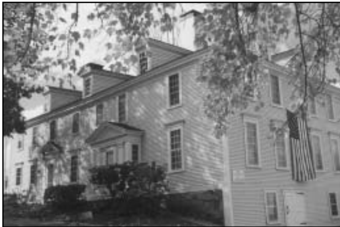
Ladd-Gilman House, Exeter

Through artifacts, documents, and programs, the AIM presents stories of the American Revolution