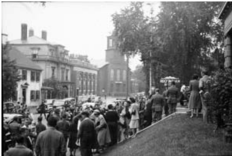
Dorothy Lamour at the Rockingham, 1940s