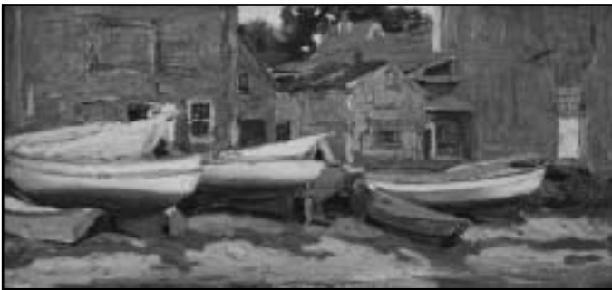
Hamilton Easter Field, Cove Dories, c. 1915, 10 x 20 inches, oil, from the OMAA Permanent Collection

Located at 543 Shore Road and perched on a cliff overlooking Narrow Cove and the Atlantic Ocean,